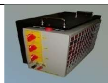
R/L/C Load Bank