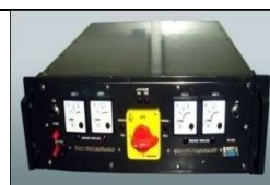
Mil Grade Power Supplies

CUSTOM MADE LOAD BANKS & POWER SUPPLIES ARE ALSO AVAILABLE