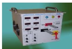
500A Regulated Power supply

SALIENT FEATURES: NON-CORROSIVE PROPERTY STABLE & RELIABLE FUNCTIONING HIGH LOAD STORAGE CAPACITY RELIABLE & SAFE